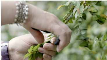
Kathy's Flood Story (Audio Described)